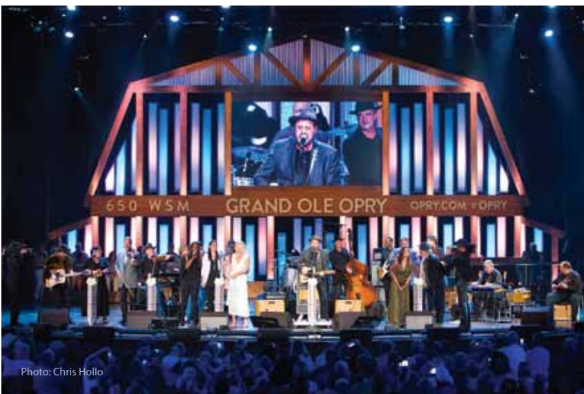
Experience a show at the Grand Ole Opry