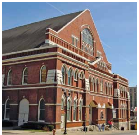
Legendary Ryman Auditorium